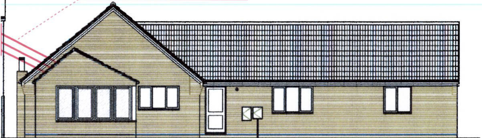
PROPOSED REAR ELEVATION (EAST)